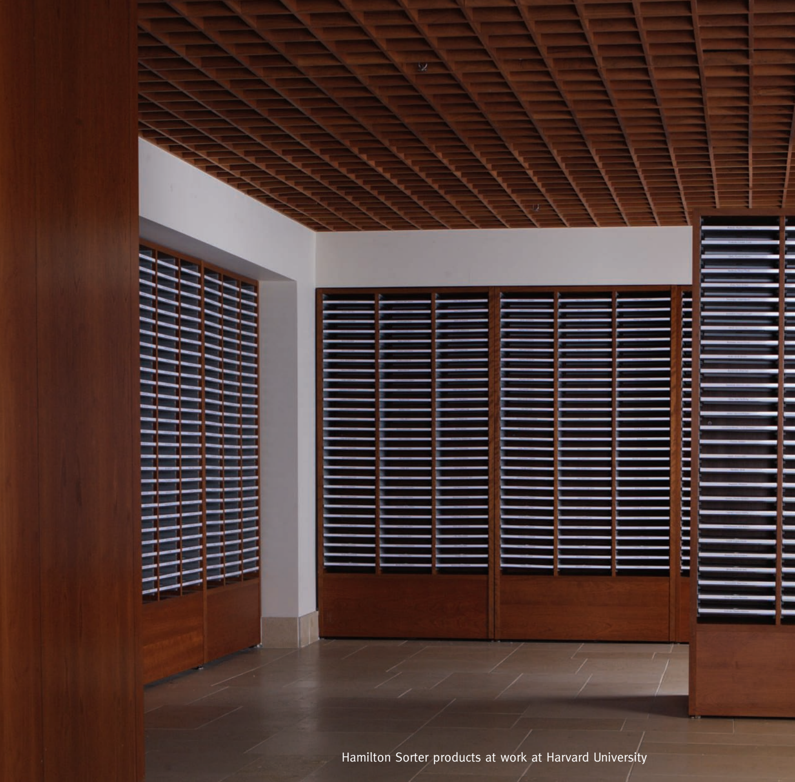
Hamilton Sorter products at work at Harvard University